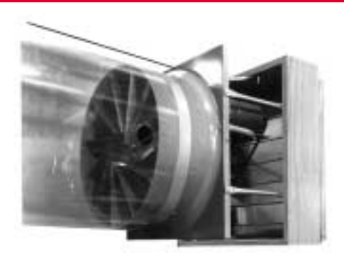
Model RC or RCA

The unique Fan-Jet is a special tube pressurizing fan with curved stationary discharge vanes (stator vanes) that recover the rotational energy of discharging air to increase performance capacity and efficiency.